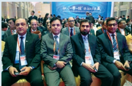
Pakistani delegation with Chinese Scientists

technology and innovation (STI) cooperation, explore effective mechanism for science and technology (S&T) cooperation, provide the platform to young scientists to present themselves, exchange ideas and create opportunities for promoting scientific and cultural exchange.