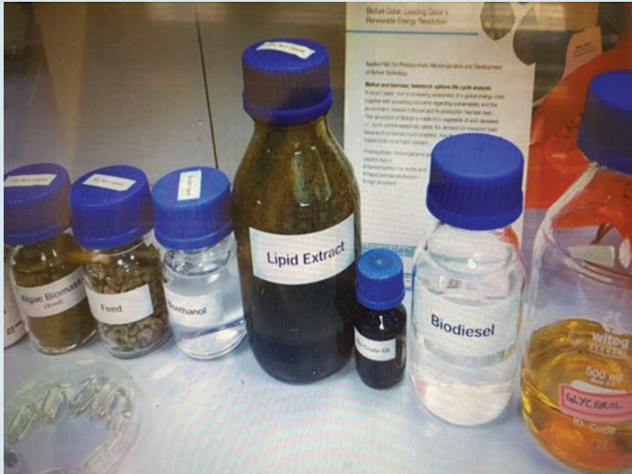
Products and byproducts prepared from Spirulina species at the Microalgae Culture Laboratory, PCSIR Labs. Karachi

promote and develops at rural scale by providing training and assistance to the local people, and the quality products (sachet, tablets and capsules) supplied to the customers, it will be beneficial for the country and for the people.