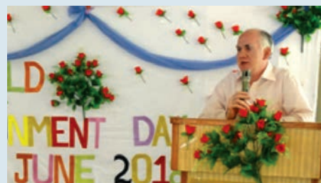
Director General, PCSIR Labs. Complex, Peshawar addressing on the Occasion.

PCSIR Laboratories Complex, Peshawar organized “World Environment Day, Connecting People to the Nature” on June 05, 2018 at PCSIR Peshawar. More than 200 students of primary level from various schools, teachers and researchers took part in the plantation activities during the programme.