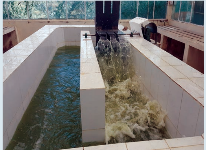
Culture of Spirulina species in the Raceway Pond (RWP) at Green House, PCSIR Labs Complex. Karachi.