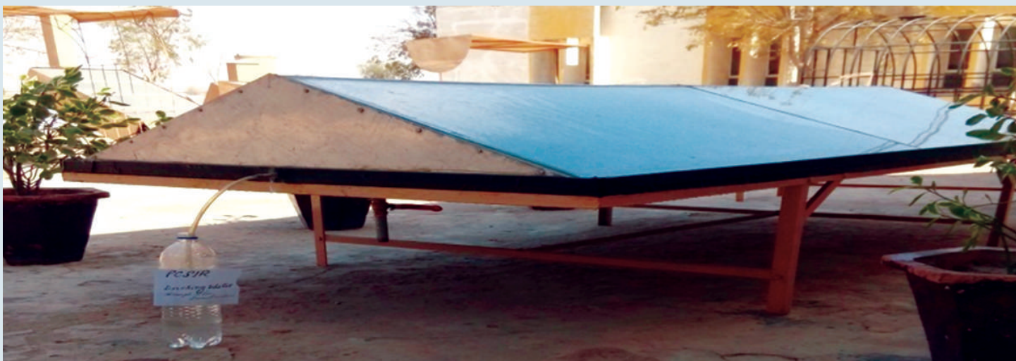
Solar Desalination Unit with Photo Catalysts (TiO 2 ) as Heat Absorber

numbers Desalination Stills with Photo-Catalyst has been completed. Further experimental work regarding their efficiency has been started.