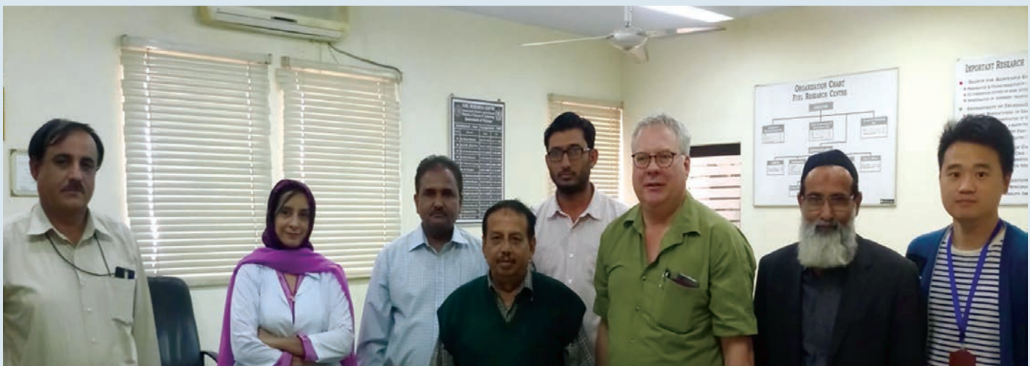
Director and researchers of FRC with the officials of Power China Resources Ltd. during their visit at FRC.