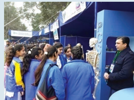
Stall of PCSIR Labs. Complex, Lahore in Lahore Science Mela, 2018.

PCSIR Labs. Complex, Lahore also participated in the "Lahore Science Mela 2018" organized at Ali Institute of Education, Lahore on January 27-28, 2018. PCSIR stall was set in this exhibition to display the R&D products.