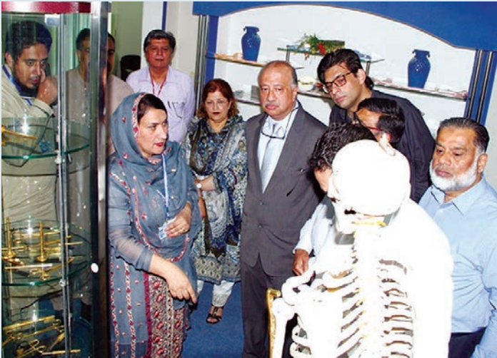
GCCI delegation visiting TBI Centre of Lahore Laboratories.

environmental problems are the major issues for the Gujranwala industrial sector mainly metal, textile & cable industries. GCCI representatives made a detailed visit to the different centres of Lahore Laboratories and showed interest in projects of mutual interest.