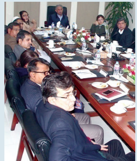
Federal Minister for Science & Technology Mr. Rana Tanveer Hussain chairs the progress review meeting at PCSIR Laboratories Lahore.